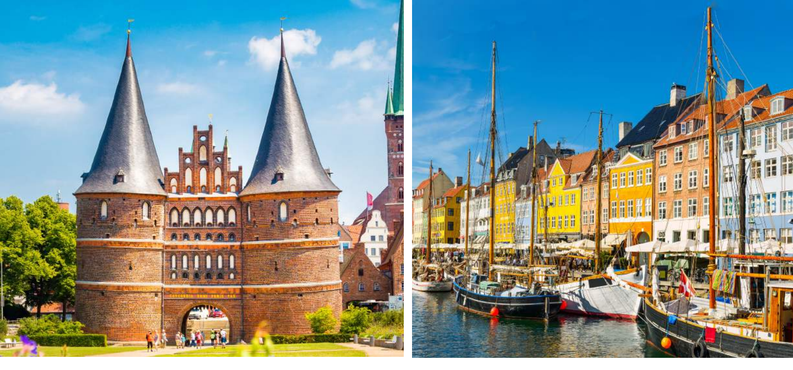
Holstentor, Lübeck, Germany (left) and Copenhagen, Denmark (right)

contrast, tour the Groninger Museum, a futuristic structure showcasing modern and contemporary art. After lunch, learn about traditional printmaking at the GRID Grafisch Museum Groningen, where you will attend a specially arranged graphics art workshop. Garden lovers may choose to visit Hortus Haren, one of Holland's oldest botanical gardens, and the Museum De Buitenplaats, a botanical complex with flowery garden roofs. B,L,D