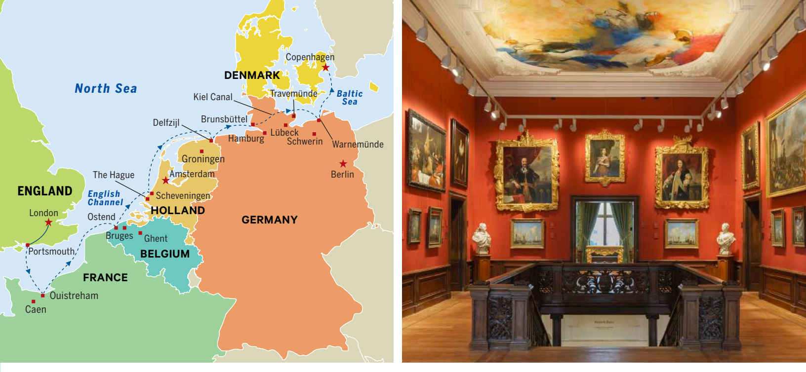
Map of the region (left); Mauritshuis, The Hague (right); and Les Falaises d'Étretat, France (below)