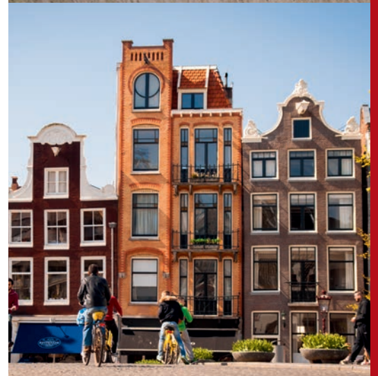
Clockwise from top left: Gouda cheese market, fountain in Het Loo Palace gardens, Red Deer in De Hoge Veluwe National Park, and architecture in Amsterdam