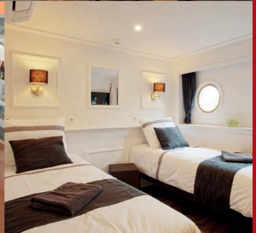
Magnifique II (top left), salon (top right), suite (above left), lounge (above center), and twin cabin (above right)