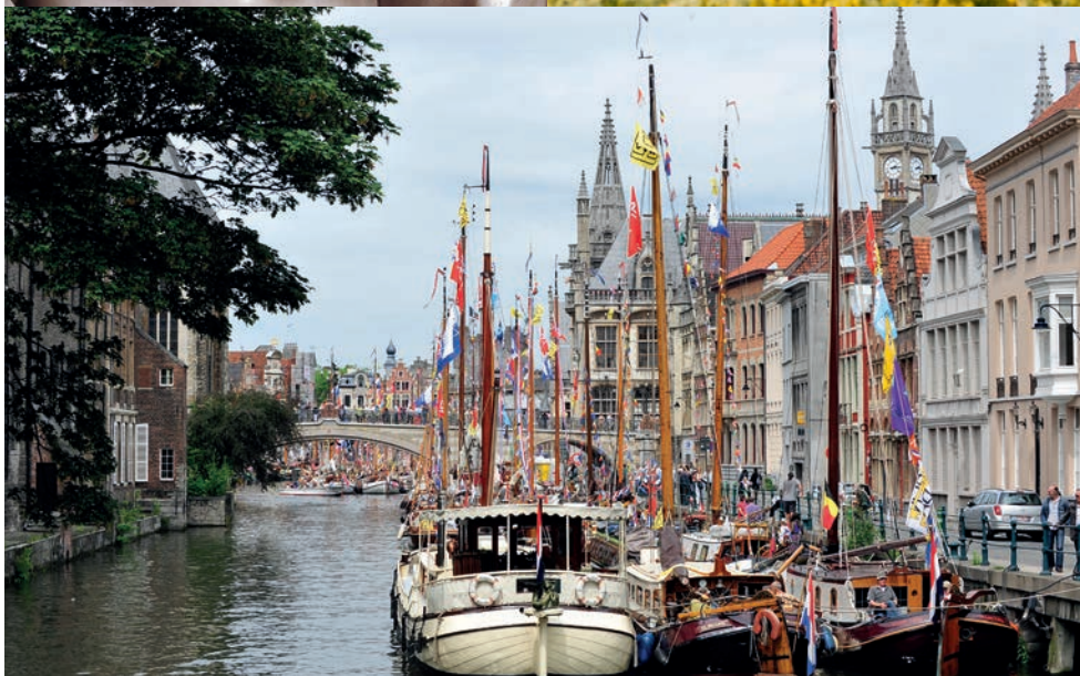
Bruges (top); Madonna and Child (detail) by Michelangelo (center left); biking in the Dutch countryside (center right); and lively waterways in Ghent (above)