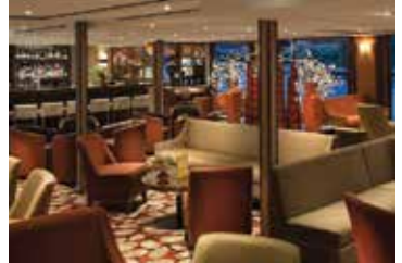
Stateroom (left); lounge (right)

AMAVIDA Launched in 2013, AmaVida brings environmentally responsible luxury cruising to the Douro River Valley. All cabins face outside and most offer balconies. Enjoy panoramic views of terraced vineyards from AmaVida 's sun deck, and experience gourmet dining with an al fresco option. Other onboard amenities include an elevator, spa, fitness center, heated pool, and complimentary internet access. The sun deck's photovoltaic solar panels provide power for the ship's operating systems, helping to preserve a pristine area that the National Geographic Society has designated a top sustainable destination.