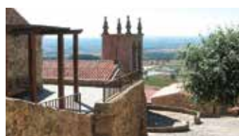
Castelo Rodrigo

Spend the morning in Castelo Rodrigo, a fortified hilltop village overlooking slopes studded with almond trees and vineyards. Pass through