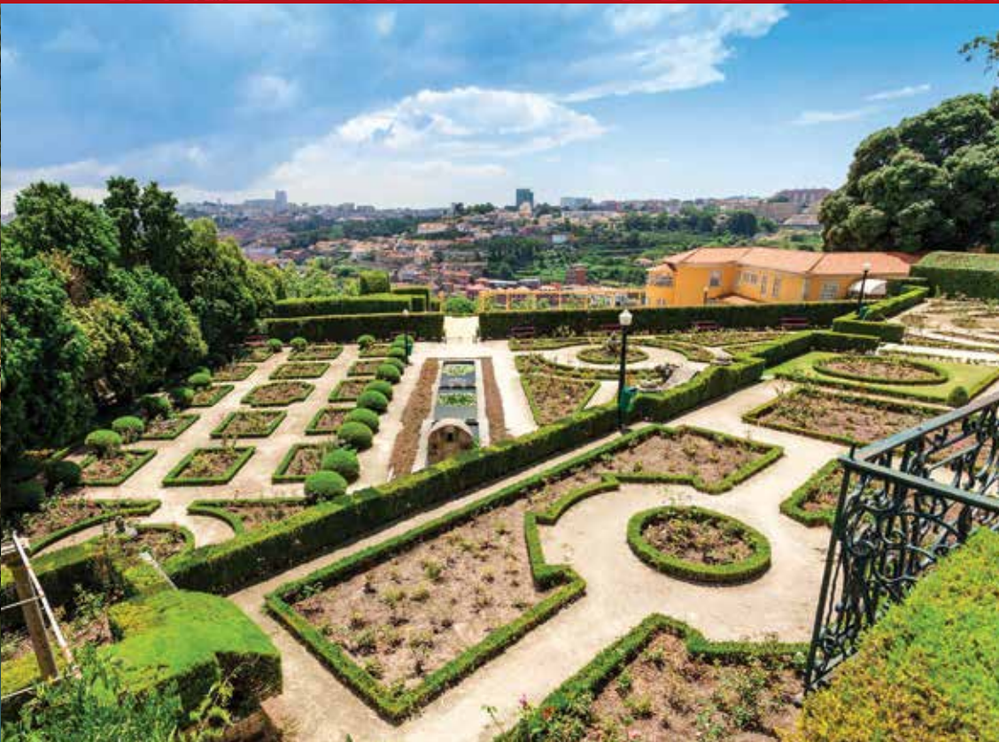
Crystal Palace Gardens, Porto