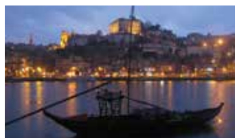
Porto

Disembark this morning and transfer to the airport for the flights home. B This itinerary is subject to change at the discretion of the Harvard Alumni Association and Arrangements Abroad. For complete details, please carefully read the terms and conditions at www.arrangementsabroad.com/terms .