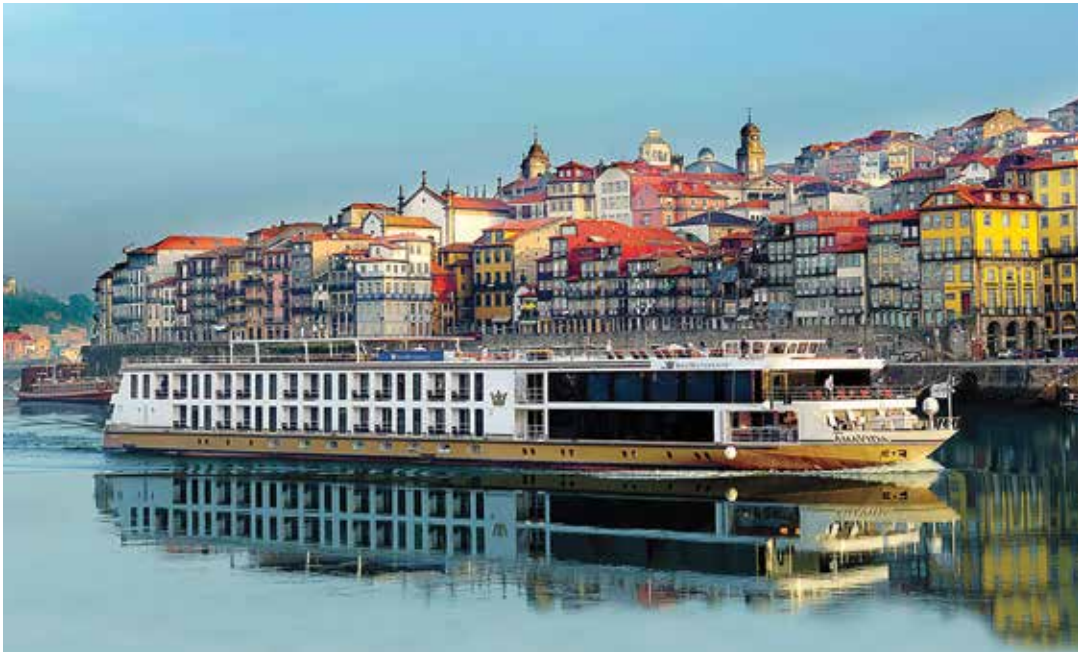
AmaVida in Porto (left) and Casa Lis, (right)