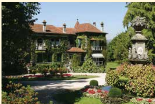
Shrine of Our Lady of Remedies (top), Casa da Música, photo by man123 (center), Quinta da Aveleda (above)