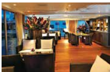
AmaDolce (left); lounge (right)

M.S. AMADOLCE Cruise Europe's most scenic waterways aboard the elegant M.S. AmaDolce , a state-of-the-art riverboat christened in 2009. All 71 staterooms and four junior suites face outside, and most have large French balconies. Relax in the lounge and experience fine international cuisine in the dining room or Chef's Table restaurant. The ship also features an elevator, whirlpool, wellness area, and bicycles for guests to use ashore. All accommodations have air conditioning and an entertainment system with television and Internet access.