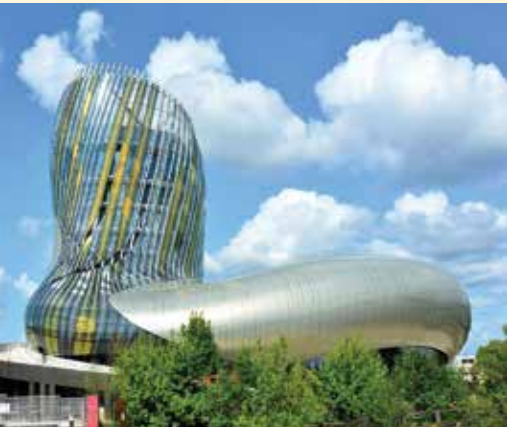
Vineyard at Saint-Émilion (top), La Cité du Vin (above)