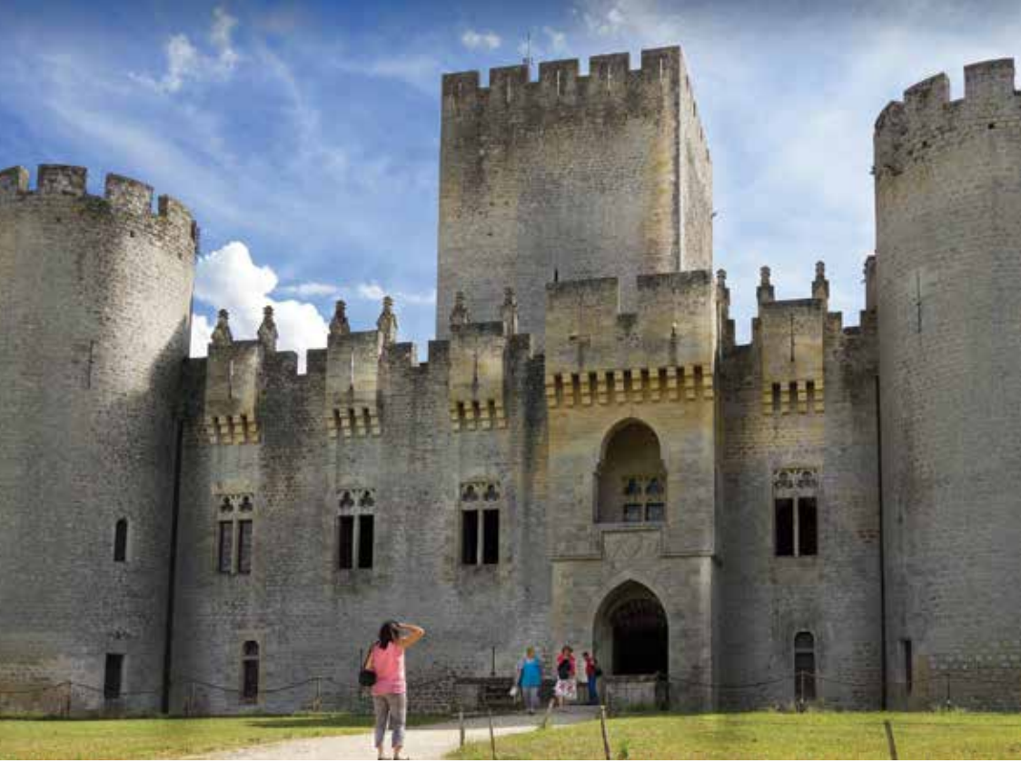
Château de Roquetaillade