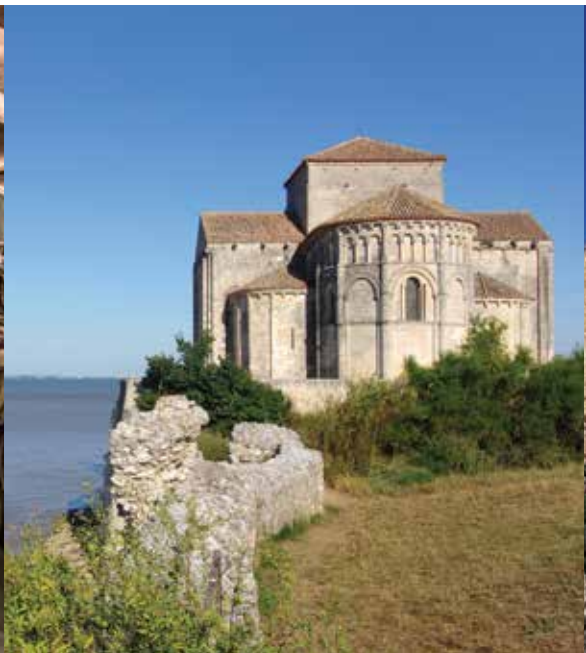
Bordeaux wine wellar (left); Eglise Sainte-Radegonde de Talmont church on the Gironde estuary (center); St. Jacques' Church, photo by [unreadable]