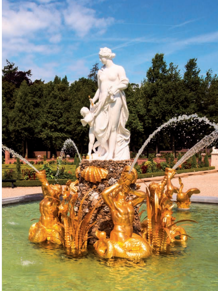
Fountain in Het Loo Palace gardens