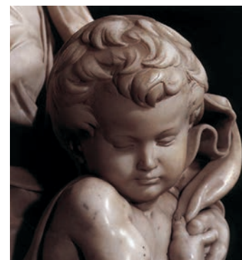
Biking in the Dutch countryside (left) and Madonna and Child (detail) by Michelangelo (right)