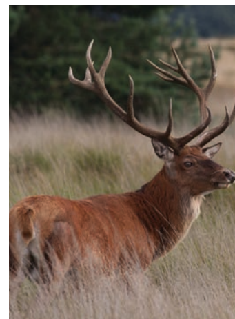
De Hoge Veluwe National Park

Disembark and transfer to the airport for the flights home. B