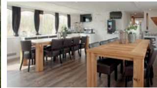
Magnifique II (left); twin cabin (top right) and salon (above right)

MAGNIFIQUE II AMENITIES: Launched in the spring of 2016, this luxury barge offers 18 comfortable cabins equipped with Wi-Fi, flat-screen satellite TVs, and individually controlled air conditioning. Her upper deck features a salon, restaurant, bar, and lounge. Her teak sun deck is partially covered and ideal for watching the passing scenery.