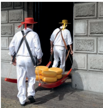
Gouda cheese market

Drive to the Gouda cheese market for tastings and talks with local producers. Bike through the village of Kinderdijk, recognized by UNESCO for its 19 windmills. Lunch is at a neighborhood farm featuring Dutch specialties. Cruise or cycle to Schoonhoven, a center for silversmiths since the 17th century, where you will have an opportunity to shop and to visit a local craftsman. Follow the Lek River to Vianen, once home to American Revolutionary hero the Marquis de Lafayette. B, L, D