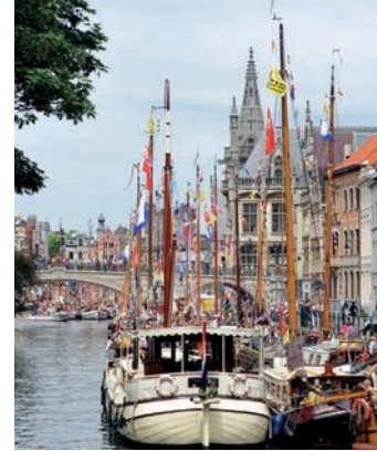
Bruges (left) and a lively waterway in Ghent (right)