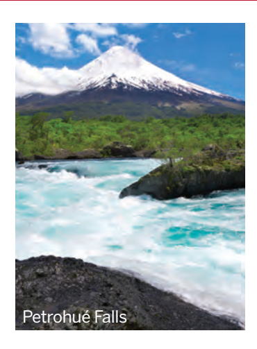
Thursday, October 13