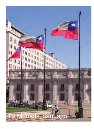
Saturday, Oct. 8 & Sunday, Oct. 9