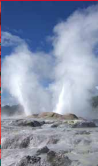
the South and North Islands.