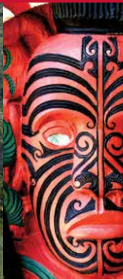
Woolly sheep, plunging waterfalls, Maori carvings, and erupting geysers are among the treasures of New Zealand that you will see as you explore