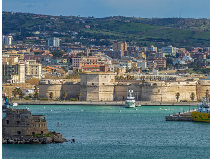
Left photo: Amphitheater of Taormina / Right photo: Harbor of Civitavecchia