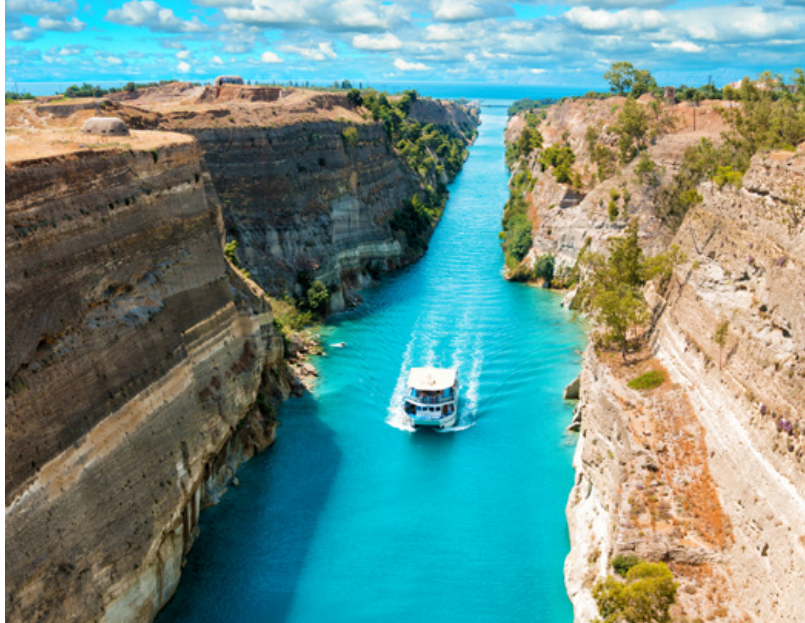
Right photo: Corinth Canal