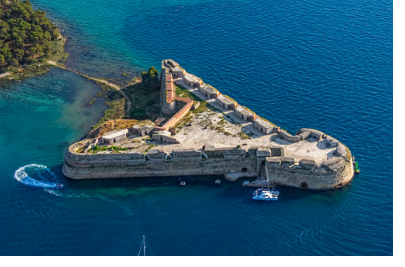
Left photo: St. Nicholas Fortress, Šibenik / Right photo: Korčula