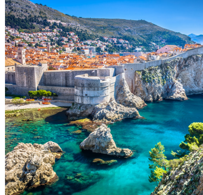
Right photo: Dubrovnik