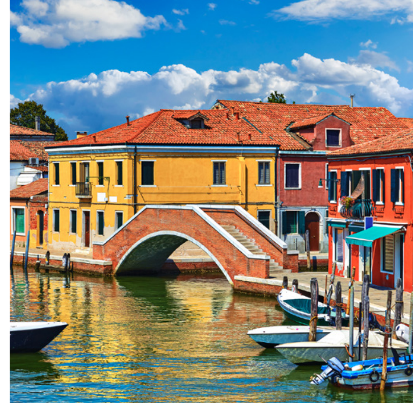
Left photo: Roman Forum, Zadar / Right photo: Venice, Italy