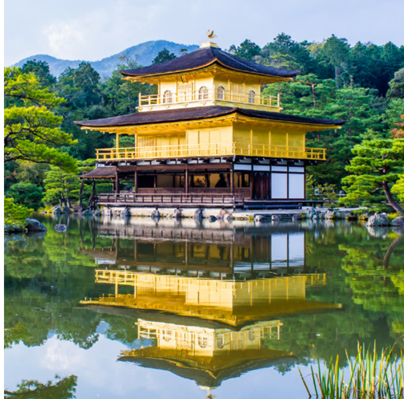
Left Photo: Bulguksa Temple / Right Photo: Golden Pavilion