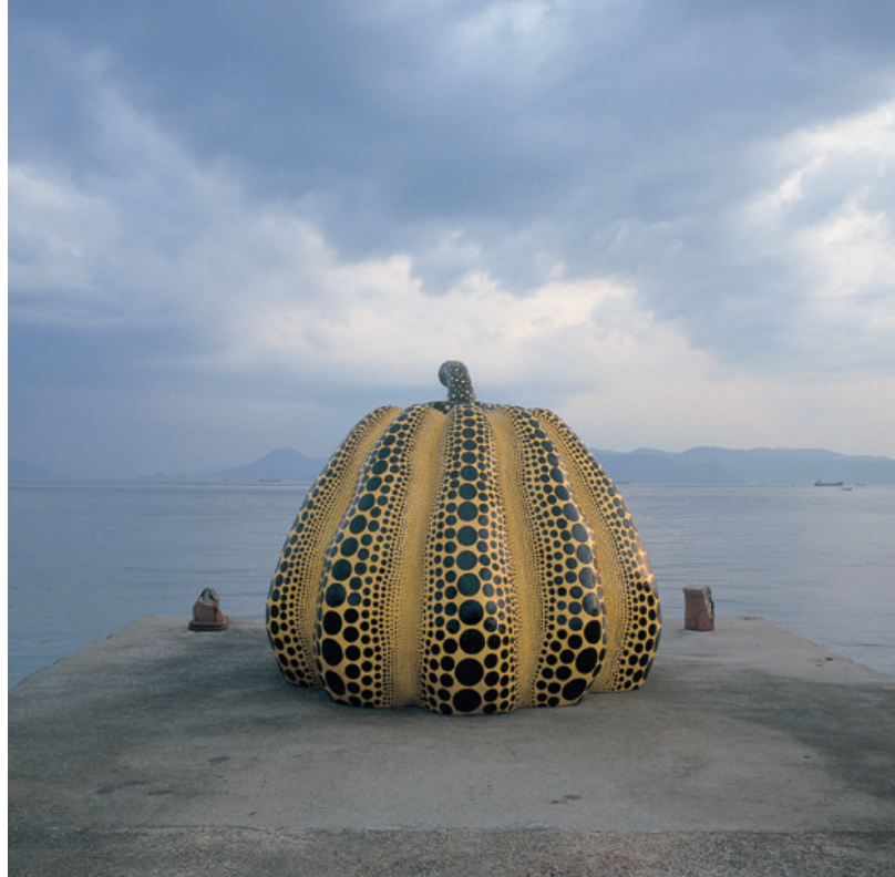
Left Photo: Gardens at Adachi Museum of Art / Right Photo: Yayoi Kusama Pumpkin on Naoshima