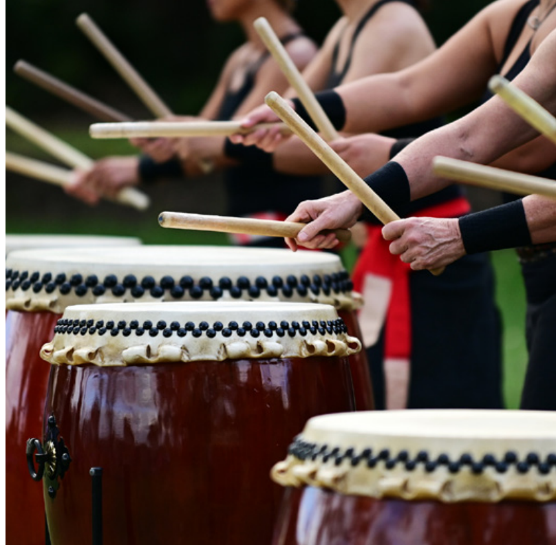
Right Photo: Taiko Drummers