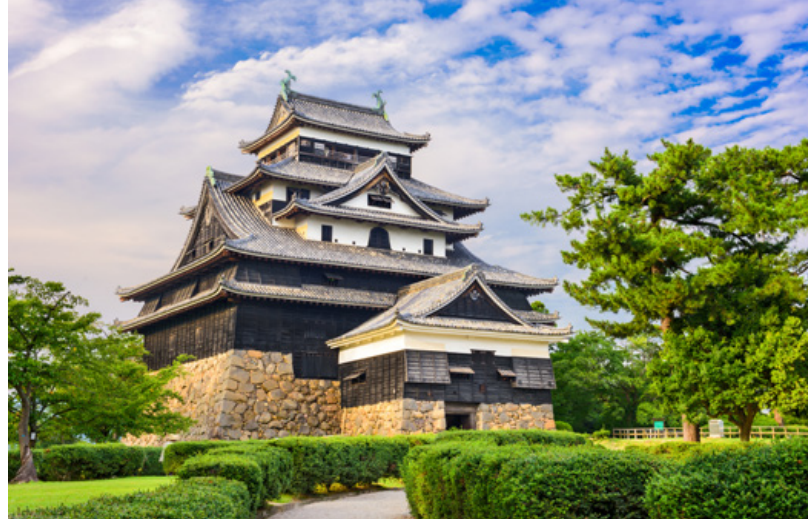
Left Photo: Ginza District / Right Photo: Matsue Samurai Castle