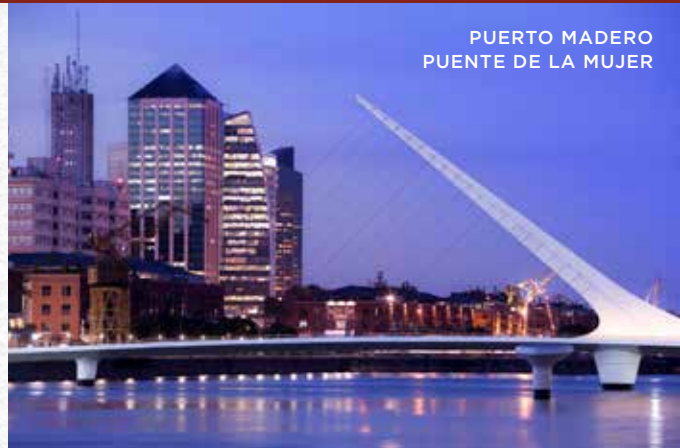
PUERTO MADERO PUENTE DE LA MUJER

Spend today immersed in gaucho culture. Visit the town of San Antonio de Areco and learn about gauchos’ history and way of life. Meet with a local silversmith for a discussion about the traditional methods of the silver trade. Continue on to a private estancia to learn how chefs prepare a traditional Argentinean asado meal. After a barbecue lunch, the amateur gauchos among us will have the opportunity to go for a horseback ride across the pampas with its huge empty skies, endless horizons, and pastures spotted with cattle. In the afternoon, enjoy tea with scones and croissants accompanied by homemade jams. PARK HYATT BUENOS AIRES (B, L)