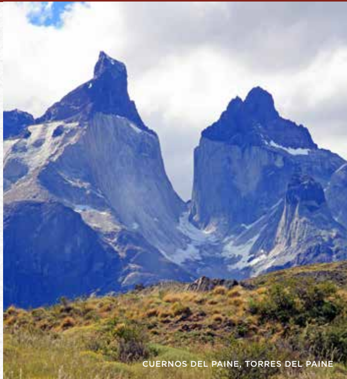
CUERNOS DEL PAINE, TORRES DEL PAINE

Arrive this morning in the U.S. and connect to your home airport.