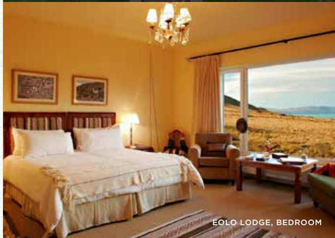
EOLO LODGE, BEDROOM

A luxury lodge the Eolo offers handsome accommodations where you can take in the beauty of Patagonia's vast, empty lands and see Lake Argentino in the distance. The rustic-chic decor reflects the style of local estancias, with soft wool throws on the large beds and photos of Patagonian landscapes on the walls. The hotel is conveniently located halfway between the city of El Calafate and Glaciers National Park, yet far from the commotion of the tourist activity in the area. The guest rooms have telephone, Wi-Fi, and central heating—which may be set at individual preference. Guests may relax in the indoor pool.