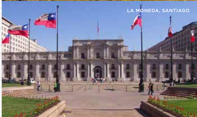
LA MONEDA, SANTIAGO