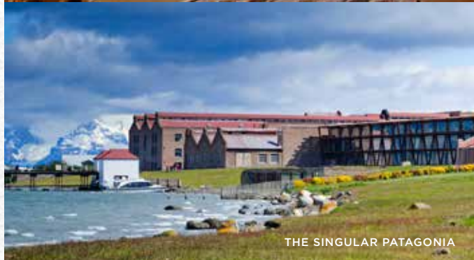
THE SINGULAR PATAGONIA

Situated on a National Historic Landmark site, rooms measure 500 square feet and feature 20-foot glass-panel windows overlooking the Patagonian fjords. A refined restaurant, an open bar, a spa, and an exclusive menu of expeditions, tours, and activities in the heart of Patagonia make this one of the most spectacular experiences in the region. The lodge offers guests access to an indoor pool, an outdoor seasonal pool, a sauna and hot tub, and free Wi-Fi.