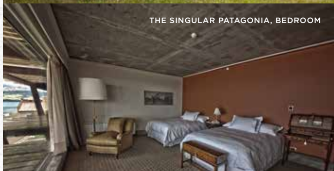
THE SINGULAR PATAGONIA, BEDROOM

The Singular Santiago is a five-star hotel located in the Lastarria neighborhood in the heart of downtown Santiago. The rooms at the hotel are an alluring blend of classic and contemporary, offering modern comforts while exuding the charm of a bygone era. Amenities include a gym, sauna, spa, rooftop bar, laundry services, deck with a pool, on site dining, and Wi-Fi.