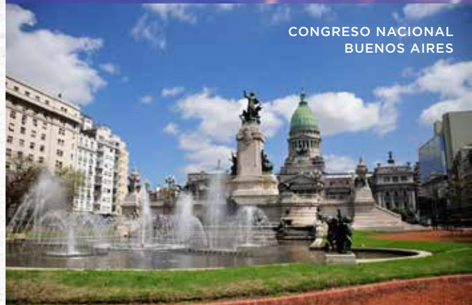
CONGRESO NACIONAL BUENOS AIRES