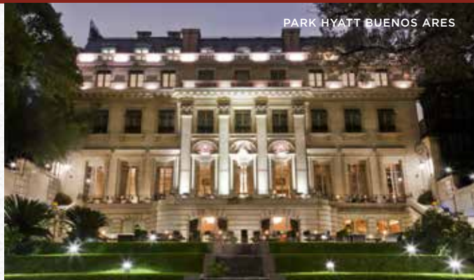
PARK HYATT BUENOS AIRES

This landmark five-star hotel blends 1930s charm and elegance with contemporary design and décor—its two buildings, a restored mansion and a 17-story tower, are connected by an underground art gallery and an expansive garden that's among the city's most attractive outdoor areas. The rooms are decorated in rich wood, elegant marble, and Argentine leather. Other property amenities include an indoor swimming pool, spa, art collection, fitness studio, wi-fi access, restaurants, full service business center, laundry service, and butler service. The hotel is perfectly located on Avenida Alvear in the heart of the French heritage district of Recoleta.