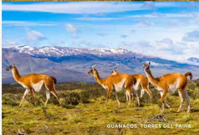
GUANACOS, TORRES DEL PAINE