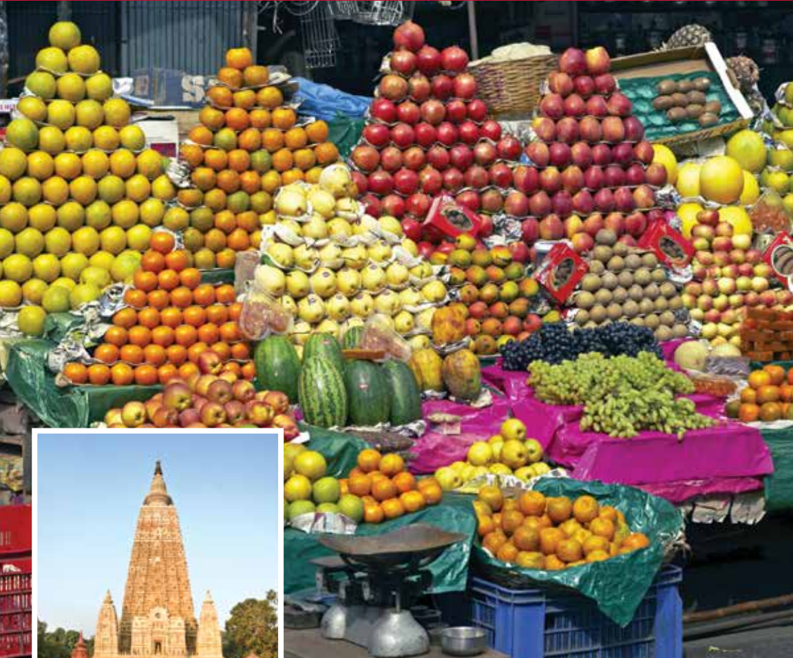
Marvel at the colorful displays of produce in Kolkata's markets (above). In Bodhgaya, learn about the significance of Mahabodhi Temple to Buddhists (inset).

December 26, 2017–January 10, 2018 • 15 nights/16 days